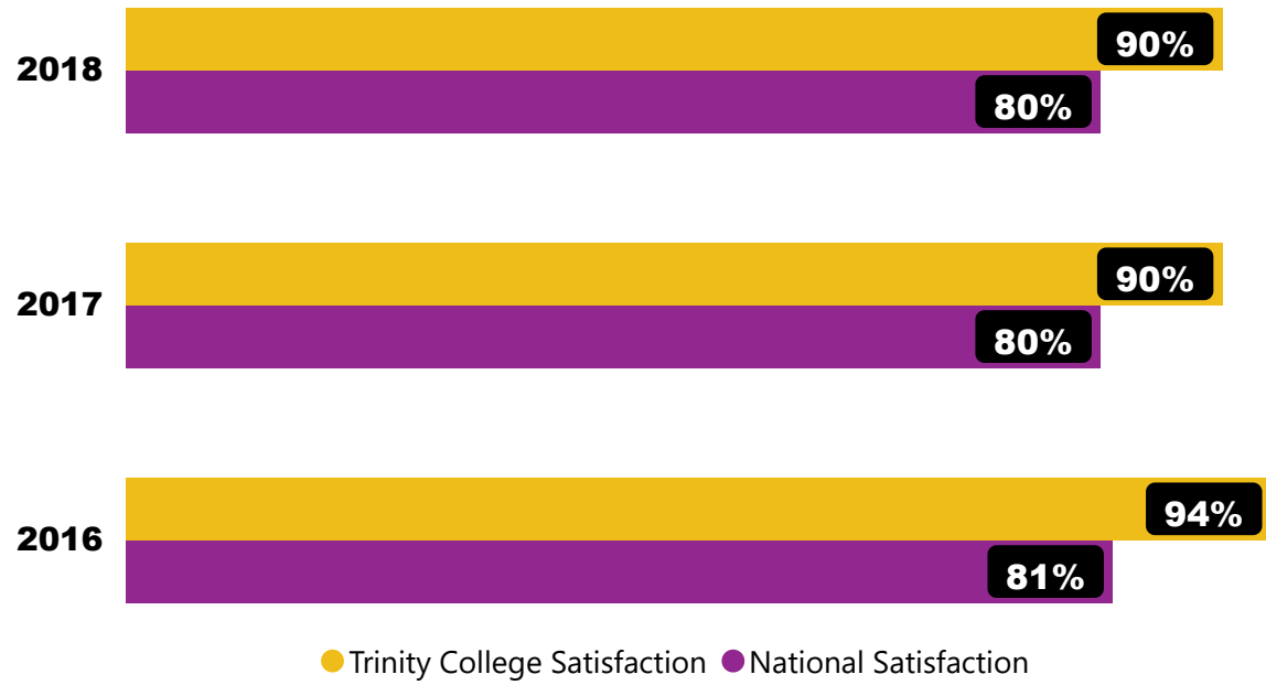
% of graduates pass licensure/ certification exam on first attempt (2016 - 2018)